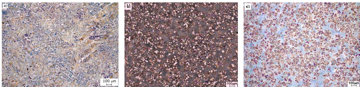
Fig.3. Microstructures of the ZnAl10 alloy: a) Initial, not modified, b) Modified by 100 ppm Ti in the ZnTi3.2 inoculant, c) Modified by 100 ppm Ti in the AlTi3C0.15 inoculant

The modification influence on the alloy microstructure (Fig. 3) is mainly manifested by limiting the dendrite growth and by increasing their numbers. Their shapes are also changing. From strongly branched they are becoming more coagulated and compact. The eutectic fraction in also increased.